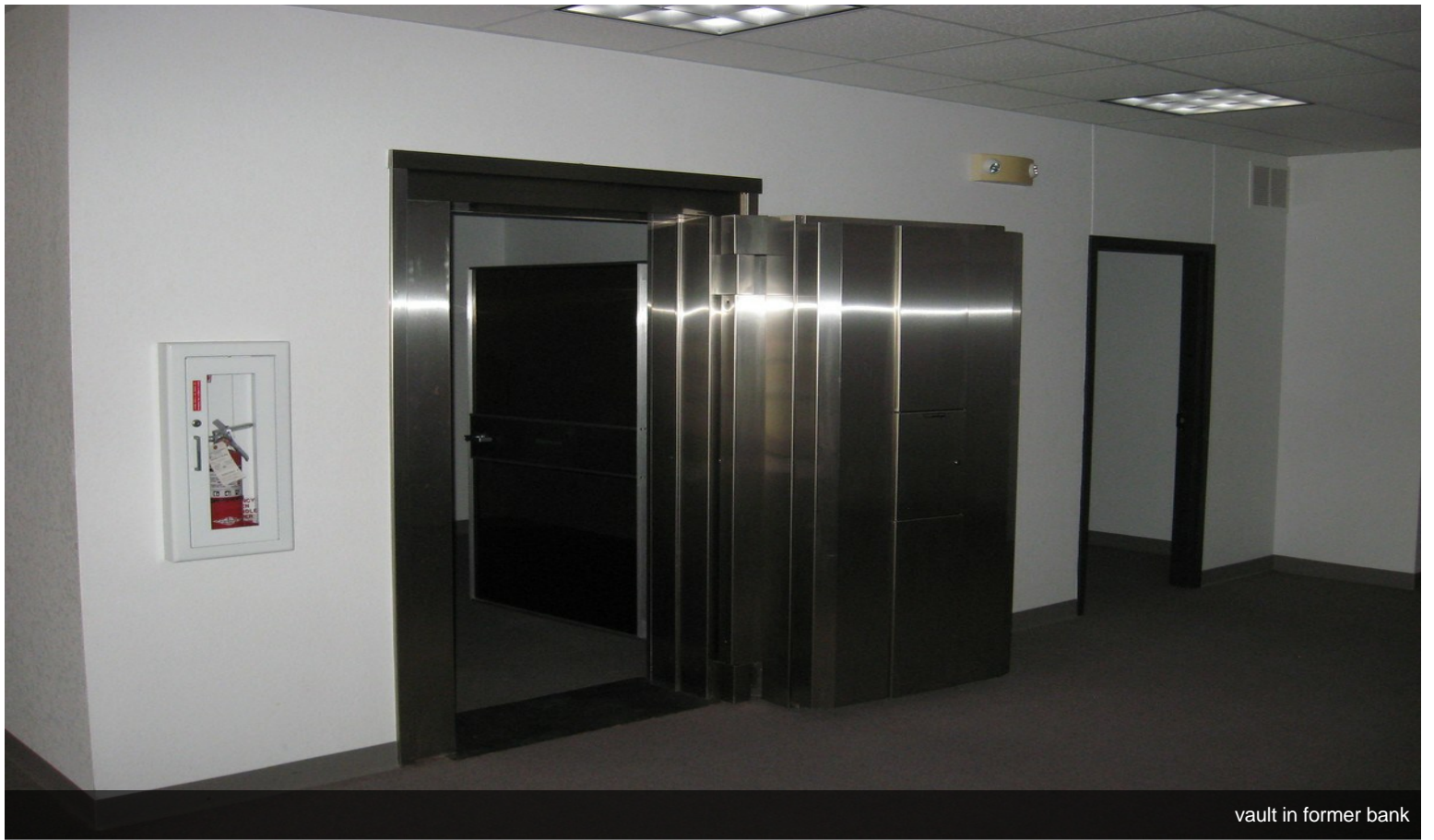
vault in former bank